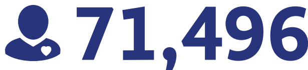
Total Employees at Year-end